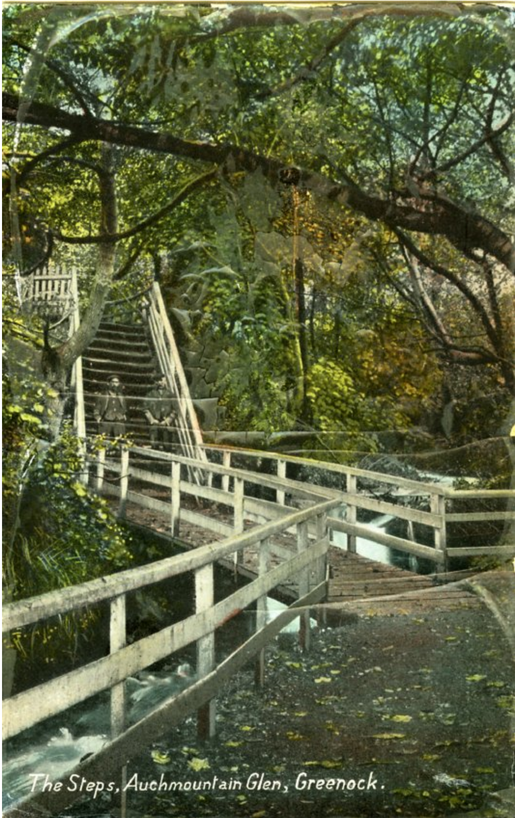
The Steps, Auchmountain Glen, Greenock.